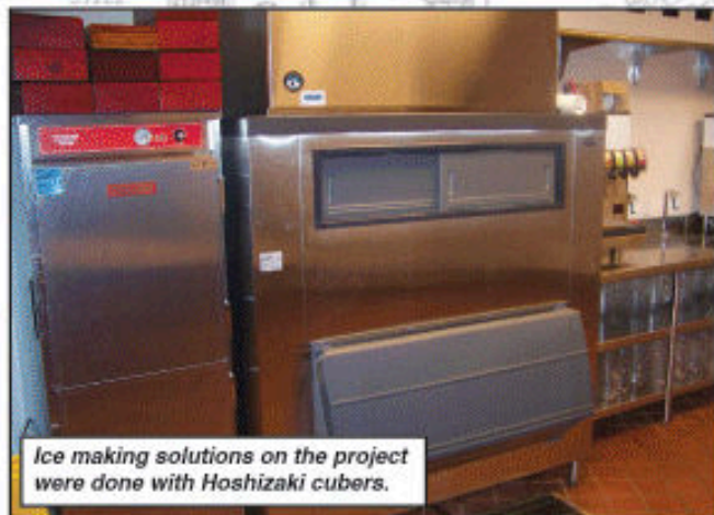
Ice making solutions on the project were done with Hoshizaki cubers.