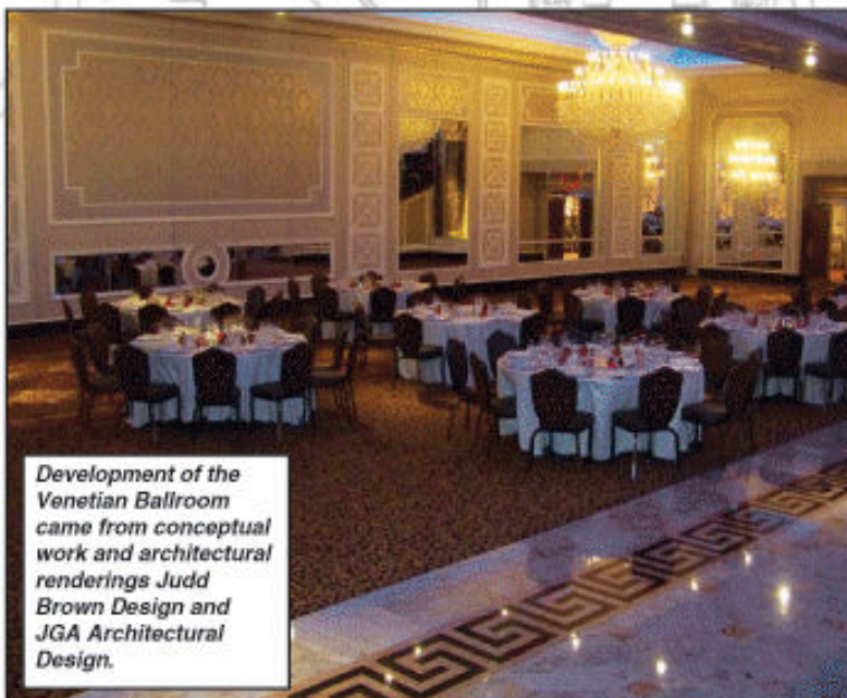
Development of the Venetian Ballroom came from conceptual work and architectural renderings Judd Brown Design and JGA Architectural Design.